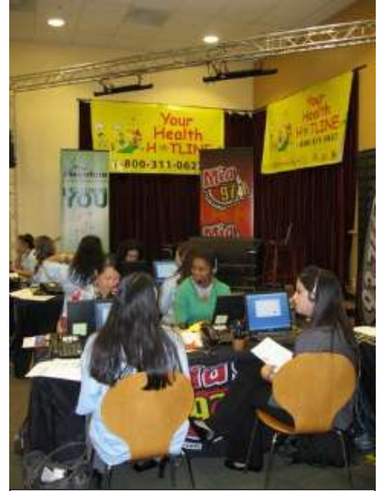
With the help of dozens of volunteers, CAA held two health care Phone-a-Thons in Southern Arizona and linked 3,000 families to health care and other benefits.

The CAA Leadership for Children Academy graduated ten more emerging leaders. These talented men and women are now working on projects in their neighborhoods and professional communities to bring new opportunities to children and families.