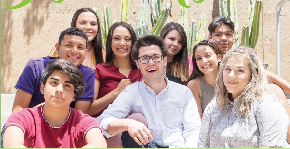
FAAZ YOUNG ADULT LEADERSHIP BOARD

Turning 18 in foster care without a stable permanent home can be discouraging, as young people are suddenly faced with the responsibility of managing everything alone, including housing, finances, health, education, and relationships.